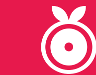
Whole Dehydrated Fruit

Many references and many different forms possible for all tastes!