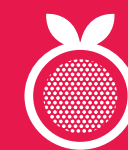
Dehydrated Fruit Powder